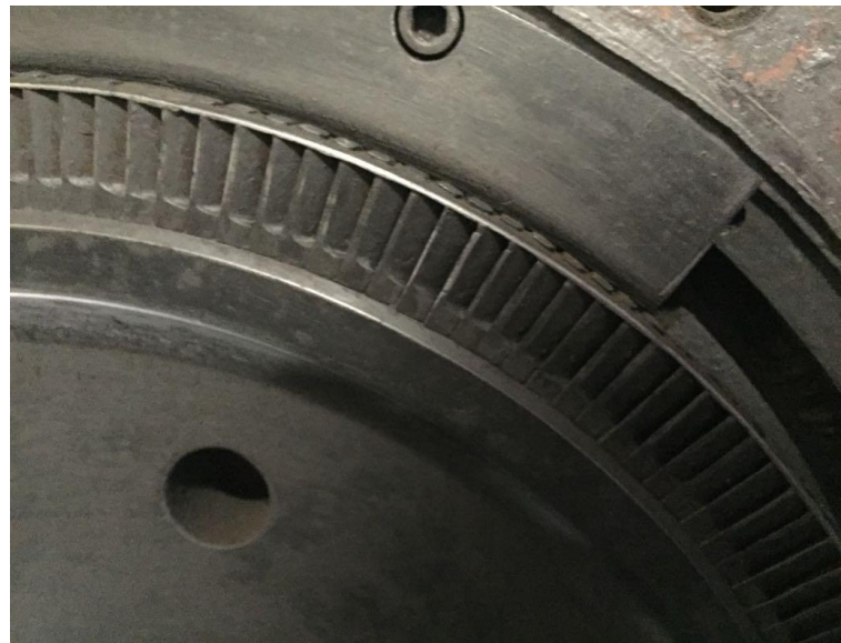
1 No. 720 kW APE Belliss (1987) Back Pressure Steam Turbine Generator Set