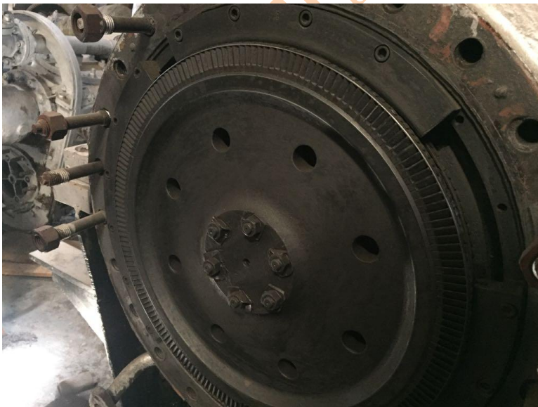
NITIN CORPORATION, MUMBAI.