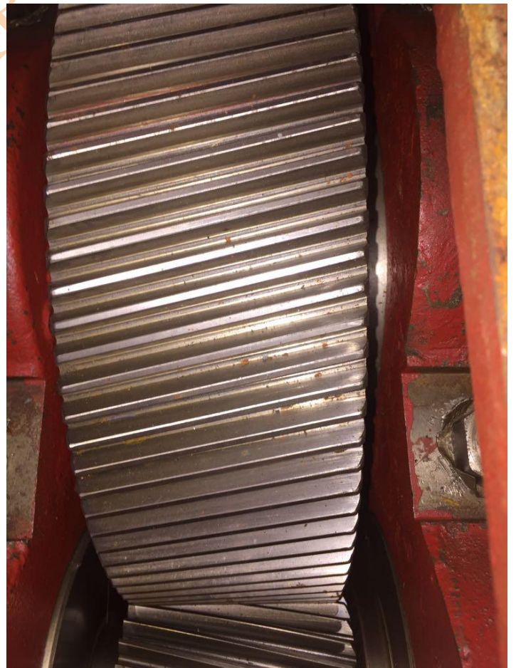
NITIN CORPORATION, MUMBAI.